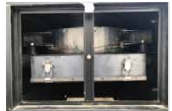
Cyclone Filter (OPTION : PM10 Filter)