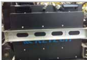
Lithium ion Battery (KOREAN Made Battery)