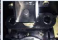
Shock absorbing Steering wheel