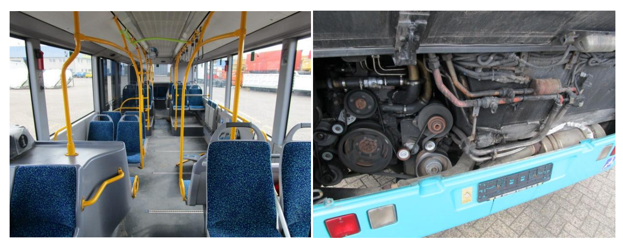
Page 1 of 3